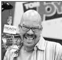
Tom Joyner 3am - 7am

KBMS Radio 1480 AM Portland's best music station