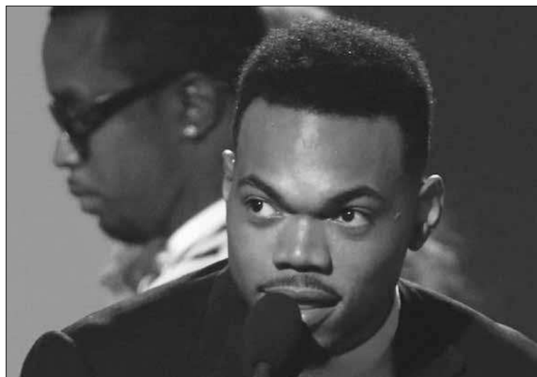
Chance the Rapper accepts the award for best new artist at the BET Awards Sunday in Los Angeles.

Solange, who had one of the last year's most critically acclaimed albums with "A Seat at the Table," won the Centric award. Hip-hop trio Migos, won best group.