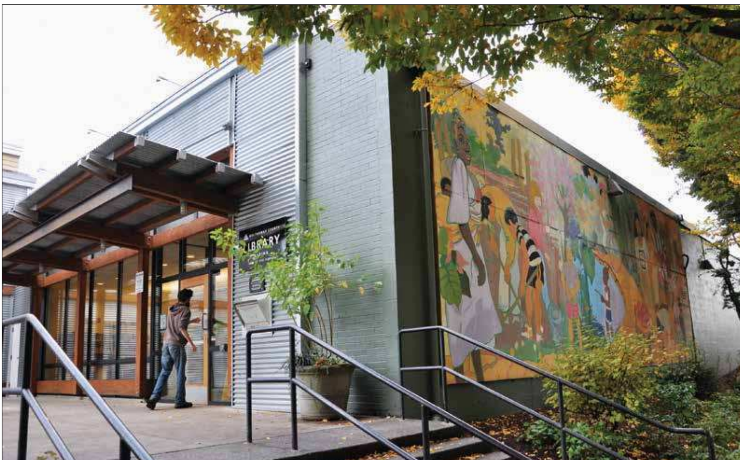
Kids of all ages can sign up for the Multnomah County Library's 2017 Summer Reading Program at any branch, including the Albina location (above) at 3605 N.E. 15th Ave.