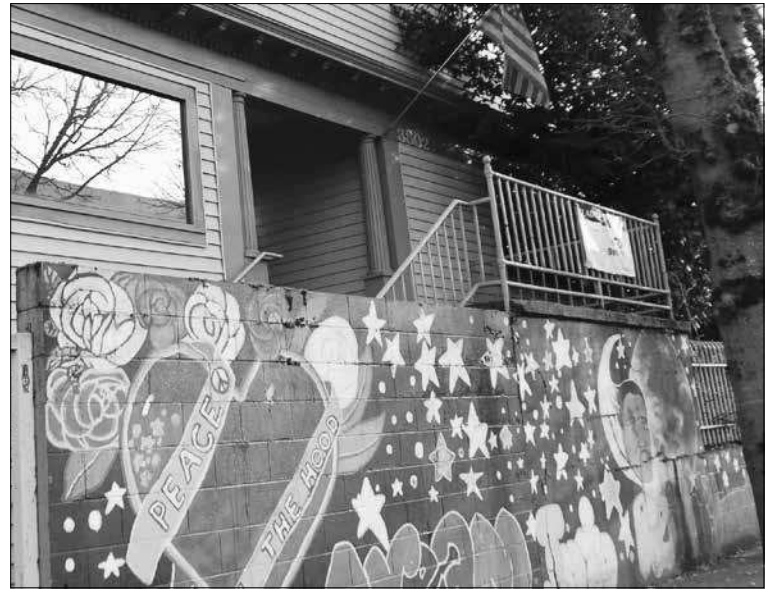
Named after the first African American elected to public office in Oregon, the Gladys McCoy Academy, located at 3802 N.E. Martin Luther King Jr. Blvd., will be torn down to make room for condominiums.

The condition of House Majority Whip Representative Steve Scalise, R-La., has been updated from critical to serious, following last Wednesday's shooting attack on GOP lawmakers who were practicing for a congressional baseball game.