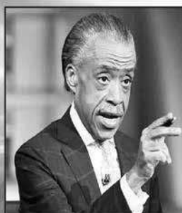
Rev. Al Sharpton 10am - 1pm