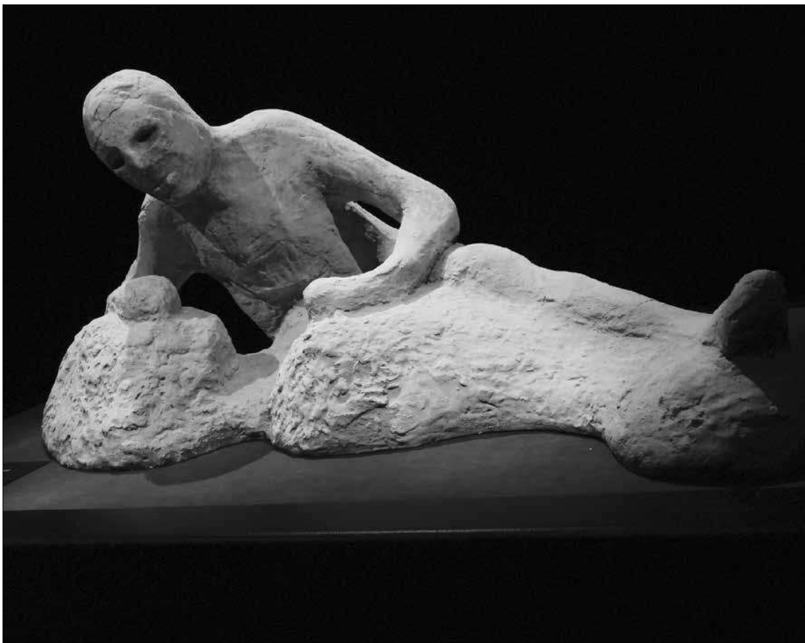
Preserved bodies cast by the eruption of Mt. Vesuvius in Italy were discovered in the ruins of city buried by volcanic debris. Pompeii: The Exhibition opens Saturday, June 24 at the Oregon Museum of Science and Industry.