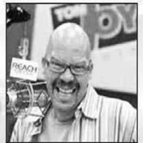
Tom Joyner 3am - 7am

KBMS Radio 1480 AM Portland's best music station