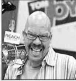
Tom Joyner 3am - 7am