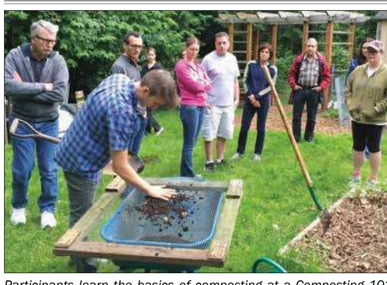
Participants learn the basics of composting at a Composting 101 workshop at the Columbia Springs urban natural area in Vancouver.

Bring in ad to redeem for a FREE "Putting My House In Order" Pre-planning guide.