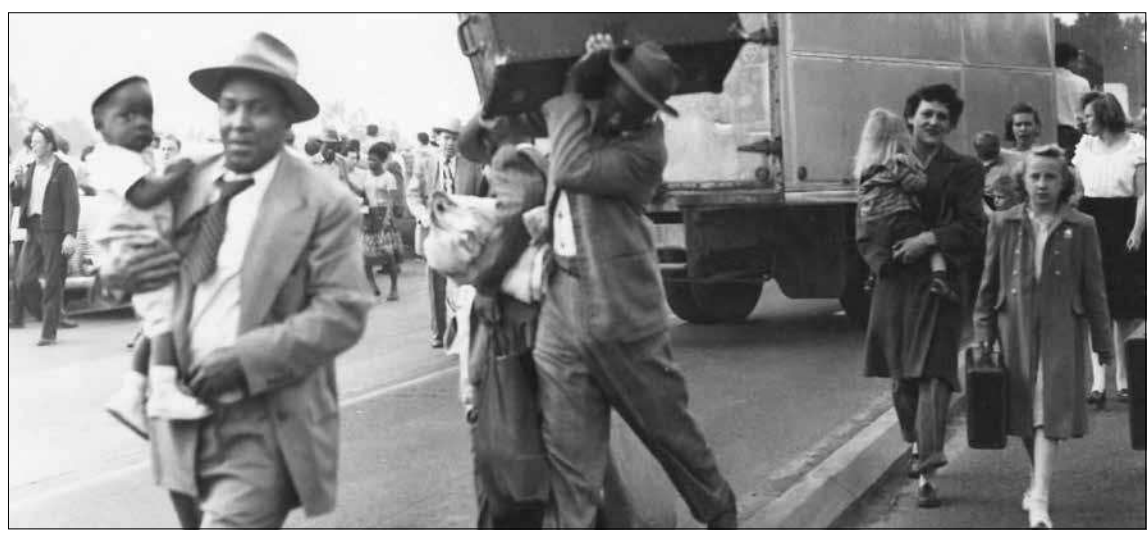
Residents flee the deadly devastation when the Columbia River breaks a railroad levy and floods the town of Vanport on May 30, 1948.