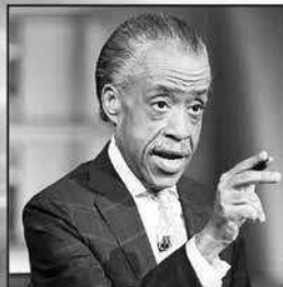
Rev. Al Sharpton 10am - 1pm