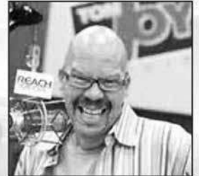
Tom Joyner 3am - 7am

KBMS Radio 1480 AM Portland's best music station