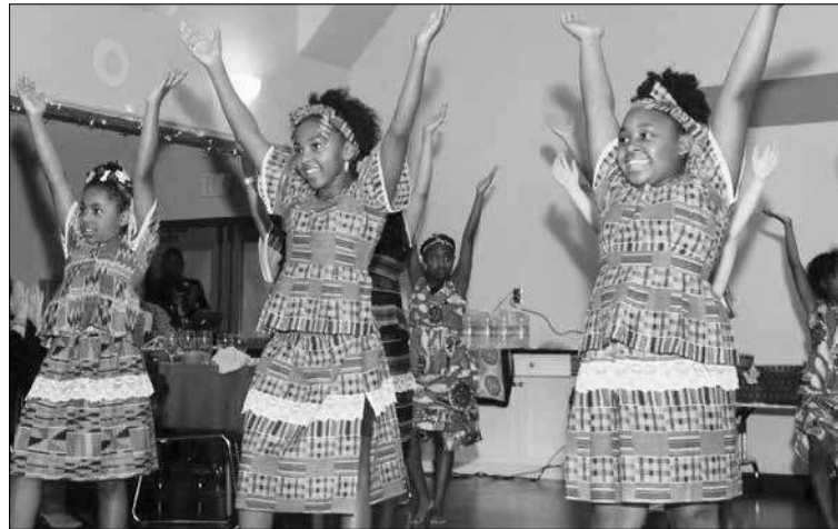
Performing in Portland's Kukatonon Children's African Dance Troupe inspires confidence in the participants and broadens their awareness of African and African American cultural traditions.