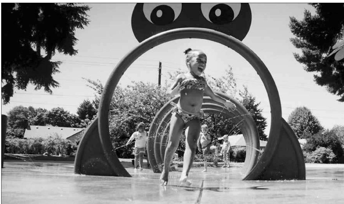
The splash pad at Peninsula Park on North Rosa Parks Way and Albina Avenue is a popular way to get cooled off on a warm day.

A call out is also out for future Jefferson Dancers. If interested, the troupe will be holding their 2017-18 auditions at Jefferson's dance studio the following week, on Friday and Saturday, June 5-6, from 3:30 p.m. through 6:30 p.m. For more information, visit jeffersondancers.org .