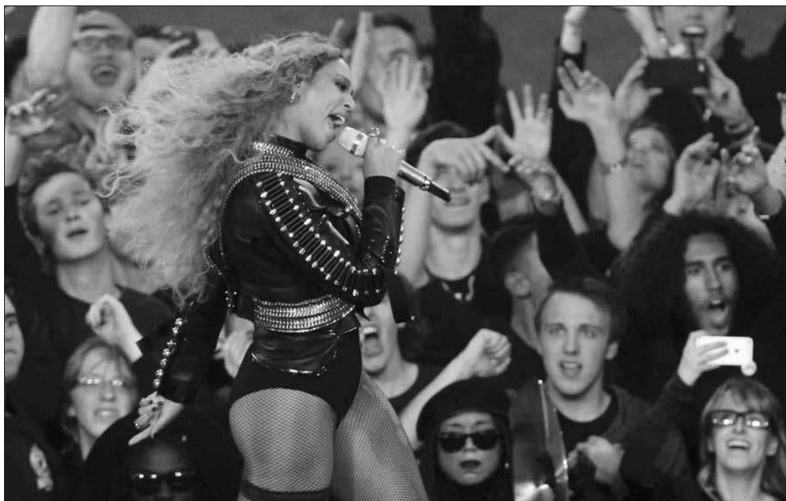
Beyonce performs "Formation" at the 2016 Super Bowl.