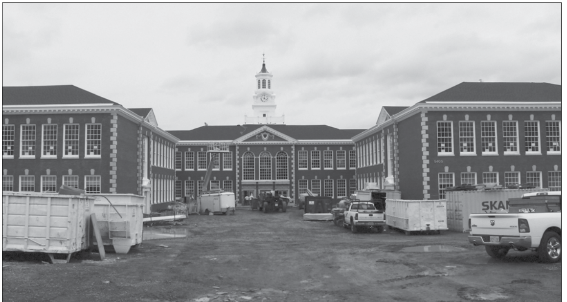
Construction crews work to complete the modernization of Franklin High School. The renovation process is preserving the campus' historic buildings, while adding new wings that complement the existing 100-year-old structure.