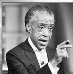
Rev. Al Sharpton 10am - 1pm