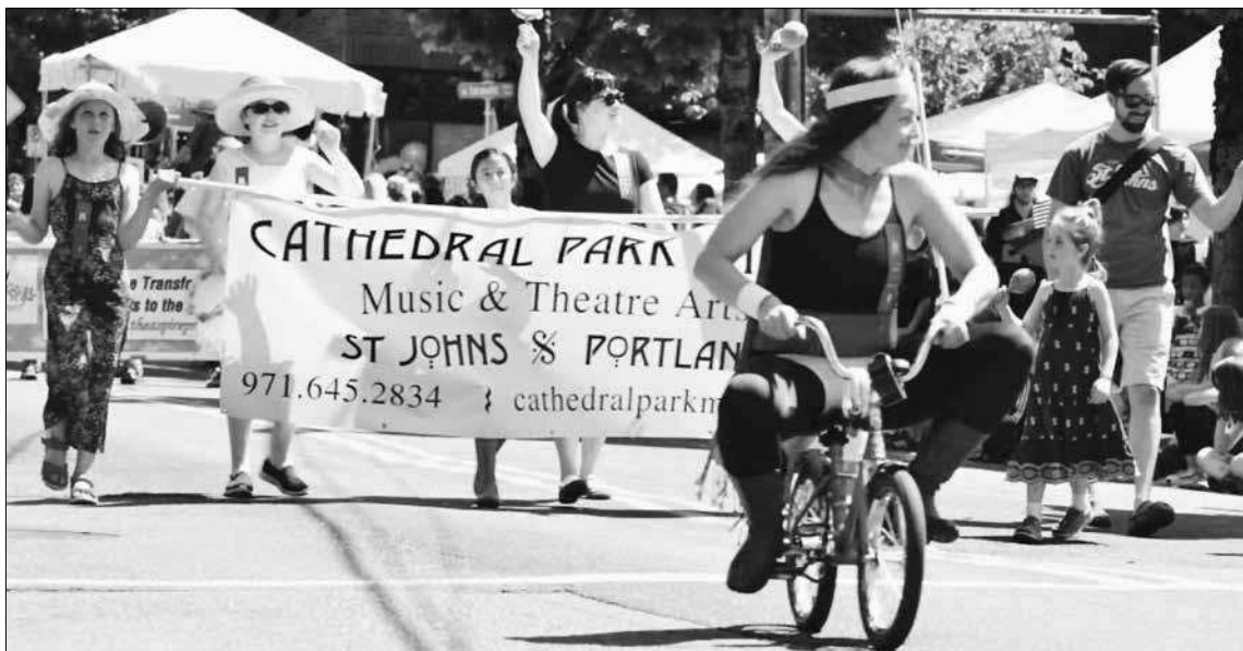
The historic St. Johns Parade brings friends and neighbors together for some community fun. The annual event returns Saturday, May 13, starting at noon.

Broadway Portland presents the most awarded new musical of 2015 and winner of four Tony Awards at Portland's Keller Auditorium for a one-week engagement, beginning Tuesday, May 16. 'An American in Paris' is the romantic story about an U.S. soldier, a mysterious French girl and an indomitable European city, each yearning for a new beginning in the aftermath of war.