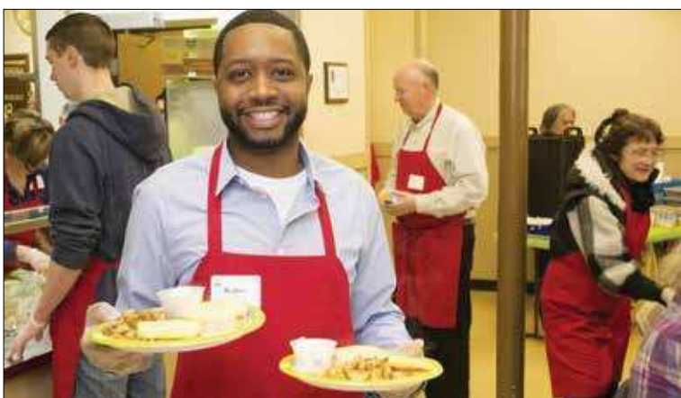
A volunteer serves Easter meals to the homeless and people in need at Union Gospel Mission's annual Easter Brunch, a free event which returns this Easter Sunday, April 16, from 10 a.m. to 1 p.m. at 15 N.W. Third Ave.