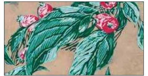
A relief reduction print/stitching from Gail Owen.