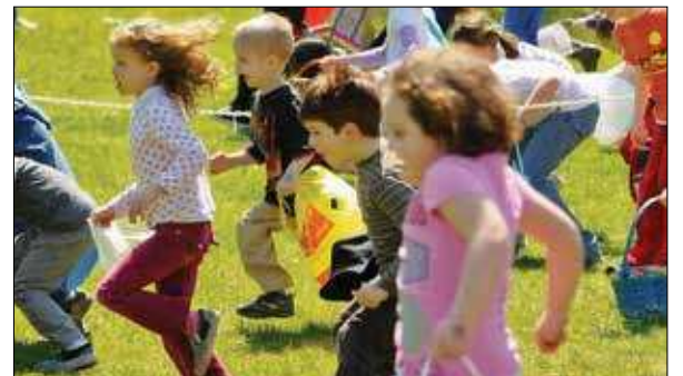
Kids take off in search of candy eggs during the Oregon Zoo's annual spring 'Rabbit Romp' celebration. This year's event takes place the day before Easter on Saturday, April 15, from 9:30 a.m. to 3 p.m.

Free with regular zoo admission, Rabbit Romp features candy "egg" hunts every 10 to 15 minutes between 9:30 a.m. and 3 p.m. Children ages 3 to 10 are invited to hunt for eggs, candy and prizes. Toddlers 2 and under can participate in a special hunt organized especially for them. Guests should bring their own baskets to collect the treats.