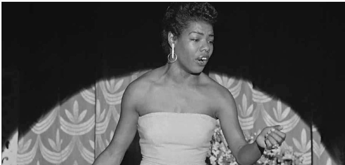
African-American poet and memoirist Maya Angelou is profiled in the documentary "Maya Angelou: And Still I Rise," screening Thursday, Feb. 9 to open the Portland Black Film Festival at the Hollywood Theater in northeast Portland.