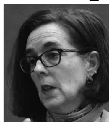
Oregon Gov. Kate Brown

Brown issued the order on Thursday, a few days after President Trump's executive order banning most travelers from seven majority-Muslim countries from entering the U.S. and stopping all refugees from entering the country for 120 days and from Syria