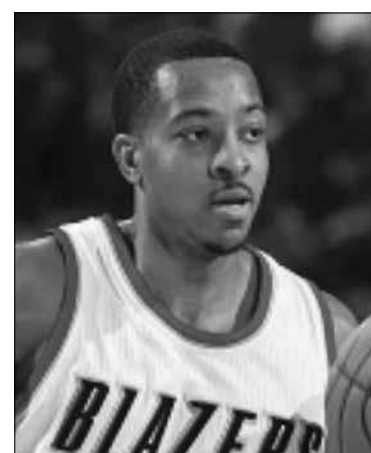
C J McCollum

In 50 games played this season, McCollum ranks 14th in the NBA with a career-best 23.4 points per game on 48.4 percent shooting. His 42.3 percent three-point field goal percentage (127-for-300) ranks 10th in the NBA and also marks a career best. He has im-