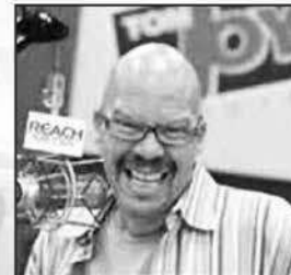
Tom Joyner 3am - 7am

KBMS Radio 1480 AM Portland's best music station