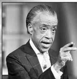
Rev. Al Sharpton 10am - 1pm

Listen Live At portlandmedium.com (Click On KBMS icon)