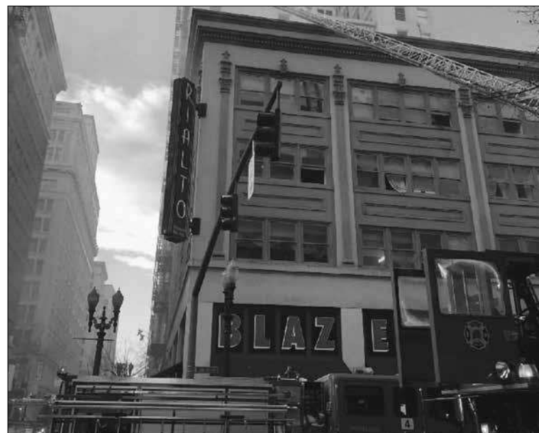
Firefighters respond when a fire erupts at the Hotel Alder, displacing low-income housing residents, downtown.

"Moonlight," the critically and audience acclaimed coming of age story of an African American boy in the South won Best Motion Picture at the Golden Globe Awards Sunday. Viola Davis won Best Supporting Actress for her portrayal of Rose in Denzel Washington's directorial adaptation of August Wilson's "Fences."