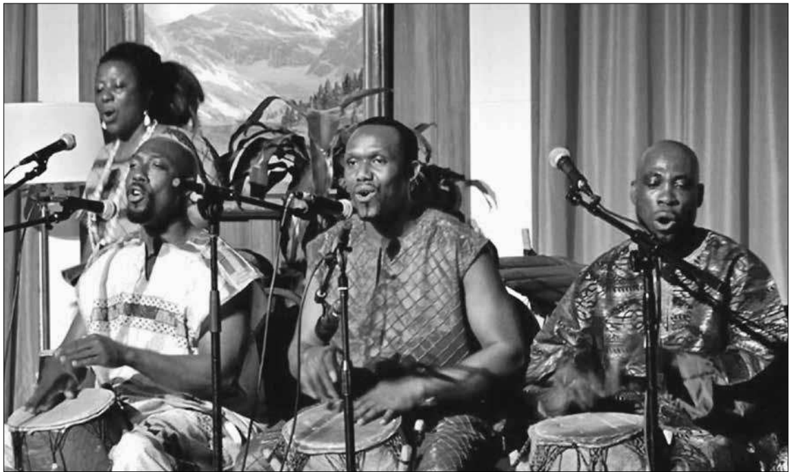
The Okropong African Dance and Drum group will entertain during a Kwanzaa celebration, Monday, Dec. 26 at the Matt Dishman Community Center.