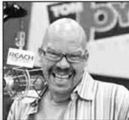
Tom Joyner 3am - 7am

KBMS Radio 1480 AM Portland's best music station