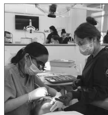
A patient gets needed dental care during last year's Dental Day at Clackamas Community College's Harmony Campus in Milwaukie.