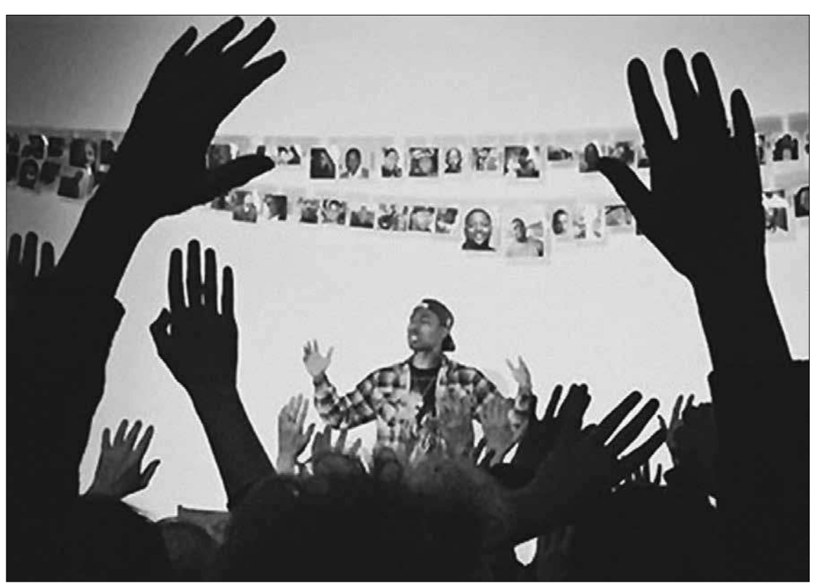
'Hands Up' delivers a gripping performance by black actors who provide unflinching accounts of what it's like to be black in America.