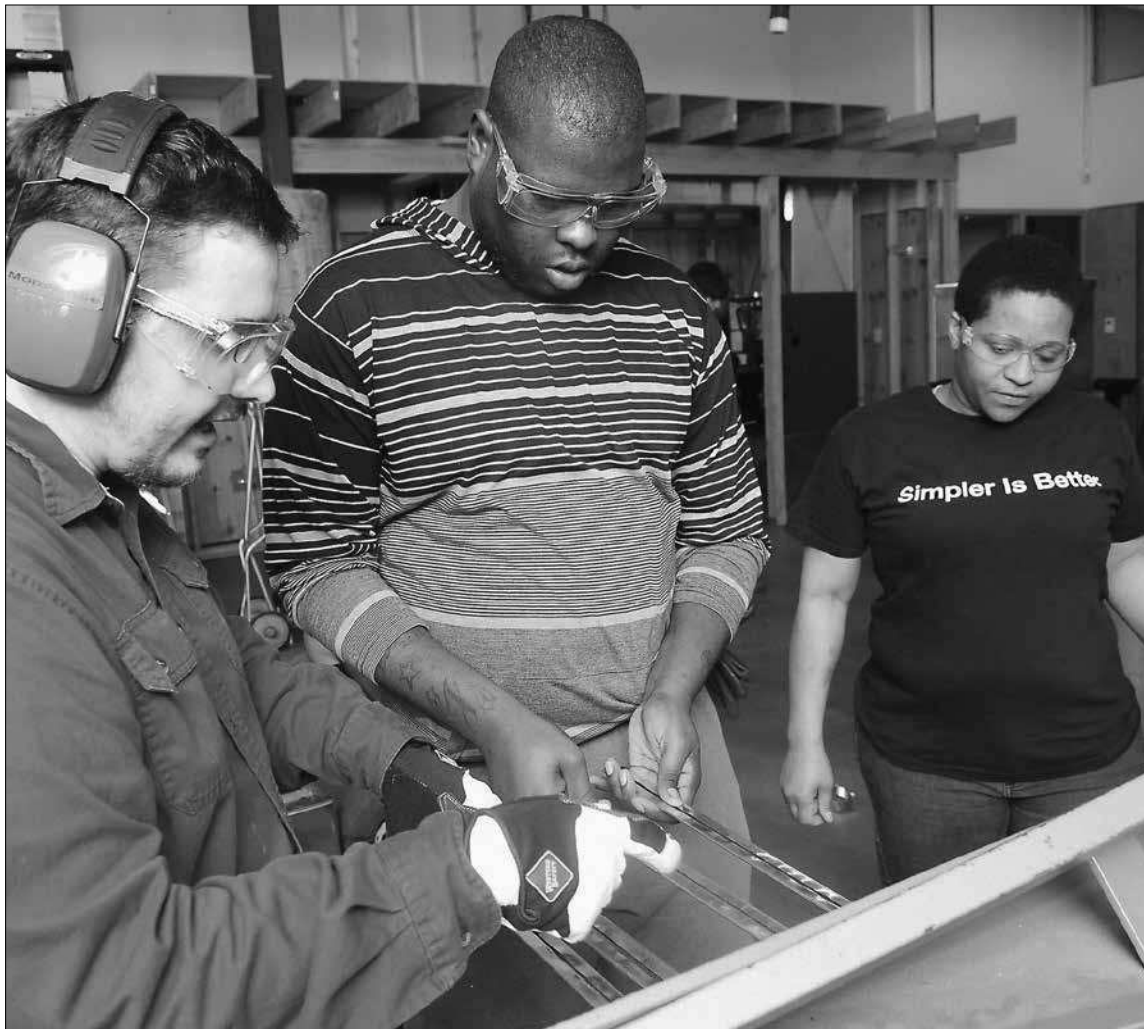
Portland Community College students get hands on training while enrolled in a HVAC class at the college's Swan Island Trades Center in north Portland.