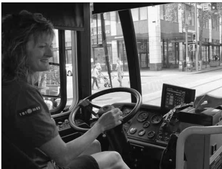
TriMet is recruiting bus drivers with a special hiring event on Saturday, Sept. 17 at the Oregon Convention Center

more than a job, you get a career. Most jobs within the agency are hired from within the bus oper-