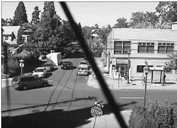
Surveillance video from a camera across the street the Alberta Market at Northeast Alberta and Ninth Avenue shows cars and people caught up in a shooting that police believe is gang related. The video was released by police in an attempt to solve the crime.

North Precinct and Gang Enforcement Team officers responded to reports of gunfire at the intersection around 4 p.m. on Thursday, Aug. 18. Upon arrival