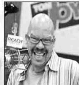
Tom Joyner 3am - 7am

KBMS Radio 1480 AM Portland's best music station