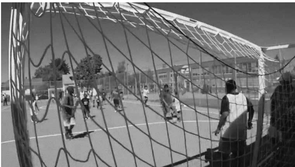
A pair of new futsal courts at Martin Luther King Jr. Elementary School support local youth program and encourage children to live healthy, active lives. The courts were made possible by the Portland Timbers and the team's community sponsors.