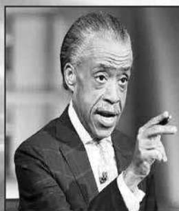
Rev. Al Sharpton 10am - 1pm

Listen Live At Portlandmedium.com (Click On KBMS icon)