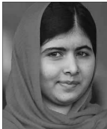
Evening with Malala Yousafzai

In October 2012, the then 15-year-old Malala was shot while travelling on a school bus with her friends in her hometown of the Swat Valley in northern Pakistan.