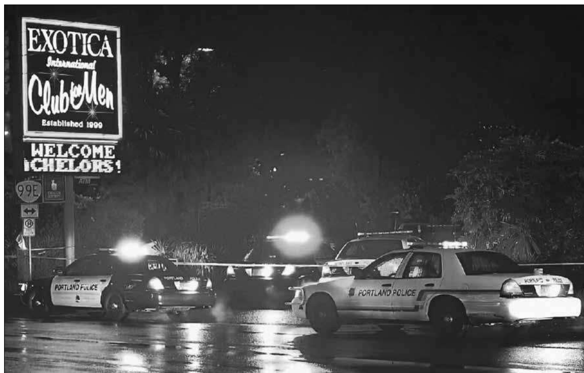
Police investigate a triple shooting in the parking lot at Exotica International Club for Men in April of last year.