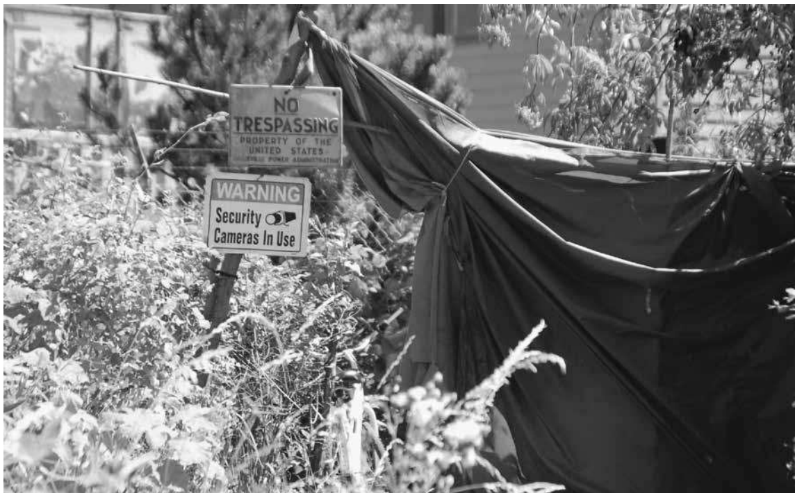
A camp along the Springwater Corridor suggests false security, though the Mayor's proposal of sanctioned encampments will make more secure outside shelters a reality.