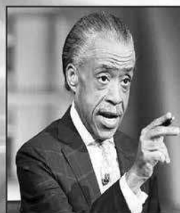
Rev. Al Sharpton 10am - 1pm

Listen Live At Portlandmedium.com (Click On KBMS icon)