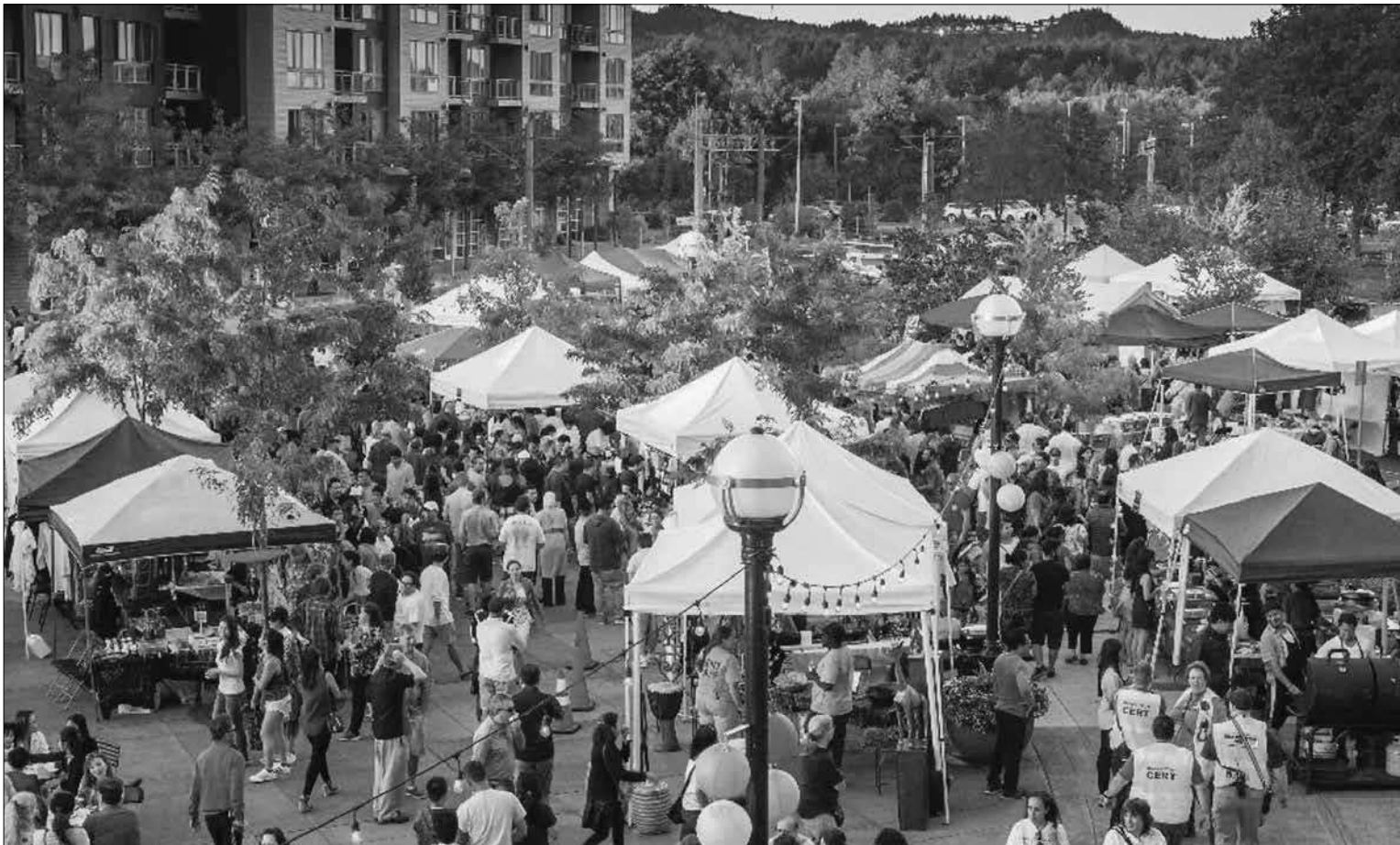
Entertainment, food and craft vendors from around the work draw people to the Beaverton Night Market, returning Friday, Aug. 13 from 6 p.m. to 10 p.m.

Envisioned as a vibrant, intercultural event reminiscent of night markets around the world, the Beaverton Night Market will return on Saturday, Aug. 13 from 6 to 10 p.m. at The Round, located just off the Beaverton Central MAX stop.