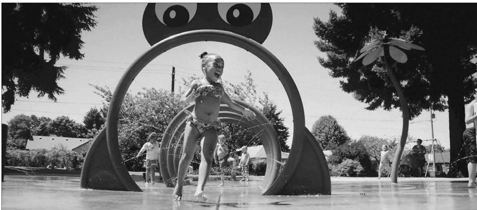
The splash pad at Peninsula Park in north Portland.