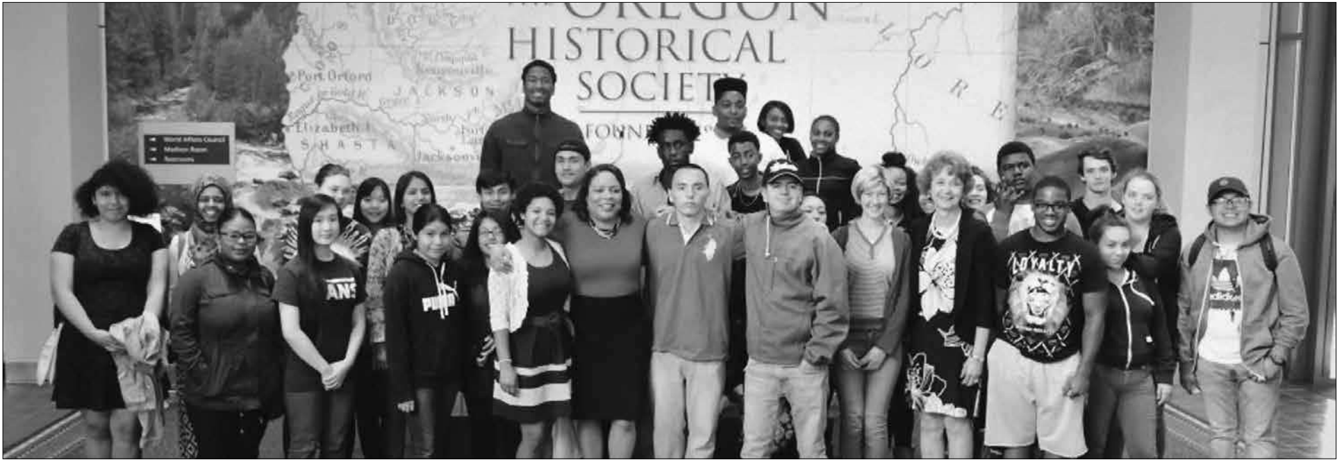
A large group of young people, ages 16-24, gather at the Oregon Historical Society to celebrate SummerWorks, the sixth year Multnomah County has joined Worksystems and other organizations to provide summer employment opportunities.