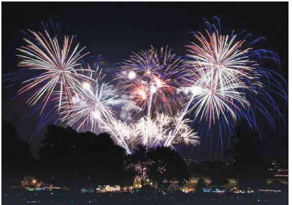
Independence Day at Fort Vancouver on Monday, July 4 will include a full day of entertainment and capped by a spectacular fireworks display.