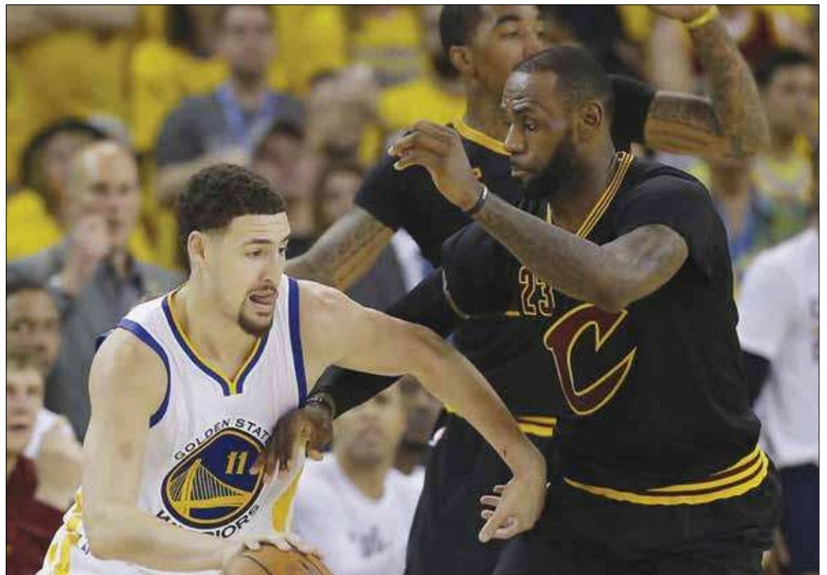
Warriors guard Klay Thompson (11) dribbles against Cavaliers forward LeBron James Sunday in Game 7 of the NBA Finals. Cleveland won the game 93-89 and claimed their first NBA championship.