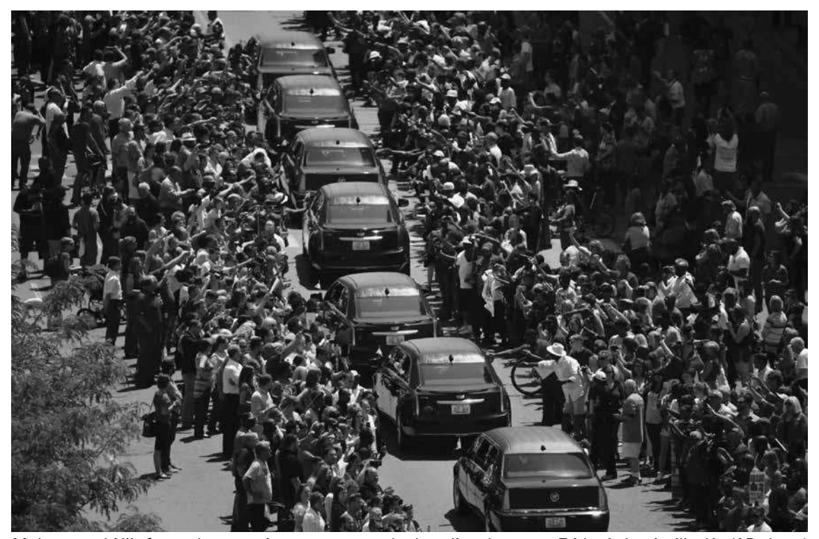
Muhammad Ali's funeral procession passes as onlookers line the street Friday in Louisville, Ky.