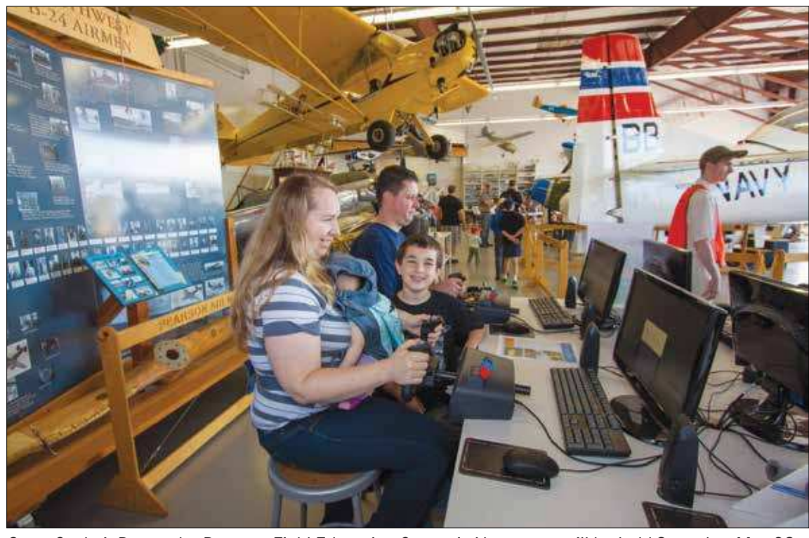
Open Cockpit Day at the Pearson Field Education Center in Vancouver will be held Saturday, May 28. offering free fun for all ages. Open Cockpit Day at the Pearson Field Education Center in Vancouver will be held Saturday, May 28, offering free fun for all ages.