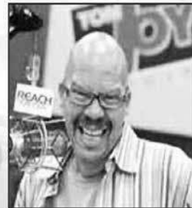
Tom Joyner 3am - 7am

KBMS Radio 1480 AM Portland's best music station