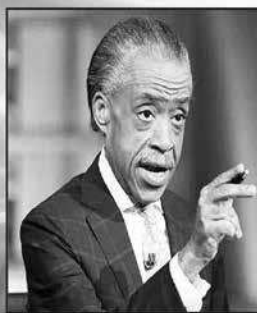
Rev. Al Sharpton 10am - 1pm

Listen Live At Portlandmedium.com (Click On KBMS icon)