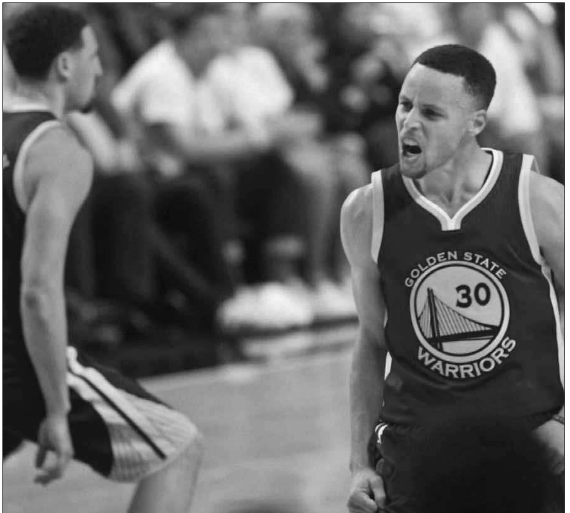
Golden State Warriors guard Stephen Curry reacts after making a basket against the Portland Trail Blazers during the second half of Game 4 of an NBA basketball second-round playoff series Monday in Portland.