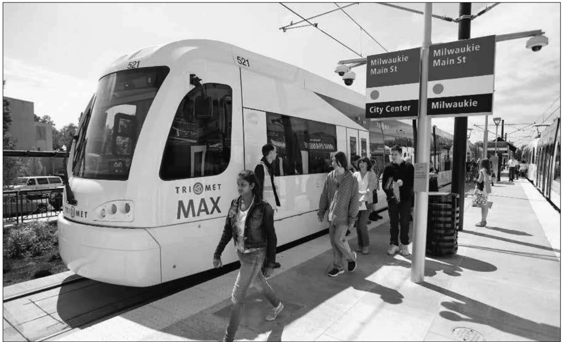
TriMet has hired Raimore Construction, a northeast Portland minority-owned business, to install 14 shelters along the new transit route.