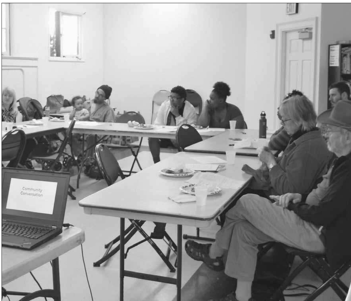
A community conversation on ways to fight housing displacement and increase housing affordability in the African American community draws residents to a recent forum sponsored by Portland Community Investment Initiatives, Inc. (PCRI)