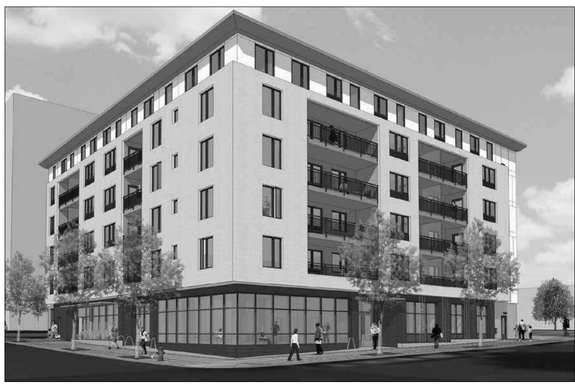
An artist's rending shows the Miracles Central Apartments coming to the neighborhood just east of