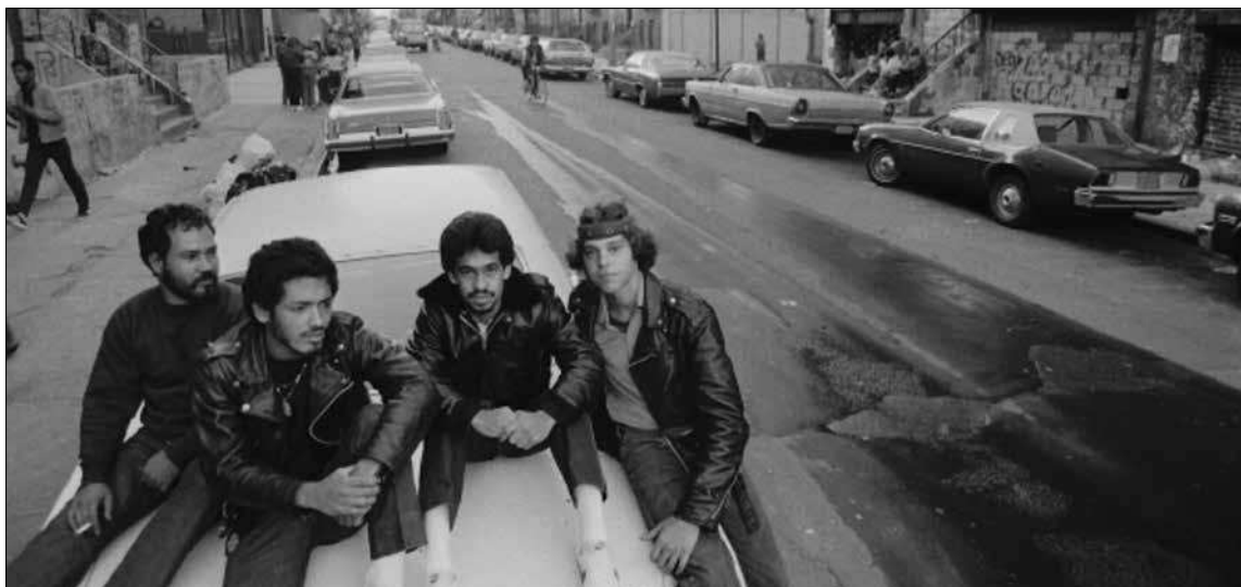
The Northwest Film Center presents Los Sures , a documentary about a poor, underserved neighborhood in New York City, and the response films that were generated in 2013 as gentrification has changed the community almost beyond recognition.