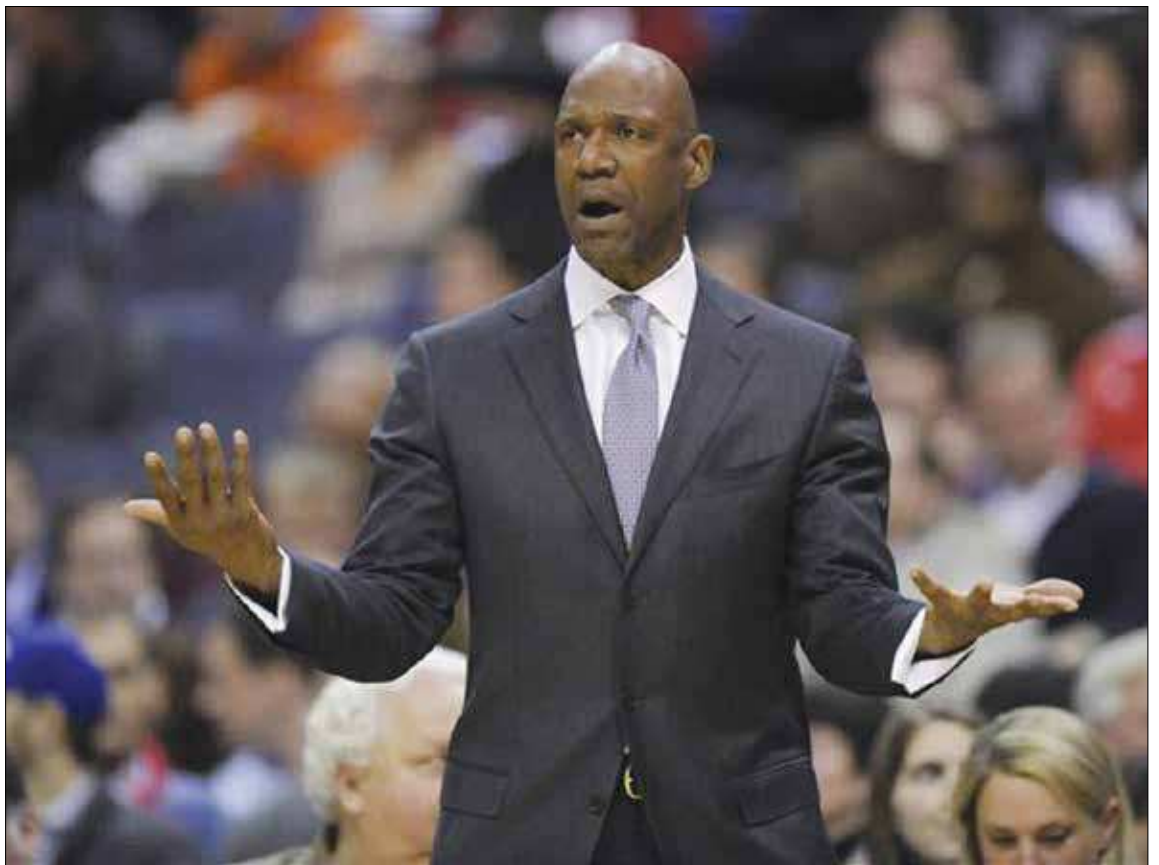
Portland Trail Blazer legend Terry Porter has been named the men's basketball coach at the University of Portland.