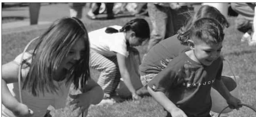
The search for candy eggs during the Oregon Zoo's annual spring celebration, Rabbit Romp. This year's event takes place Saturday, March 26, from 9 a.m. to 3 p.m.