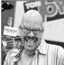
Tom Joyner 3am - 7am

KBMS Radio 1480 AM Portland's best music station