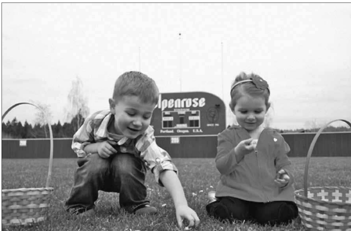
Alpenrose Dairy in southwest Portland welcomes the community to their annual Easter Egg Hunt, scheduled Saturday, March 26.

Yo dawg is gonna look like a show dawg and your kitty will be pretty.