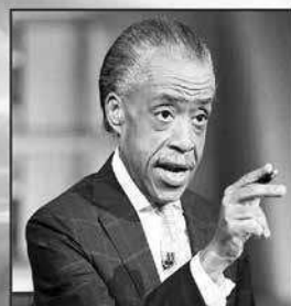
Rev. Al Sharpton 10am - 1pm