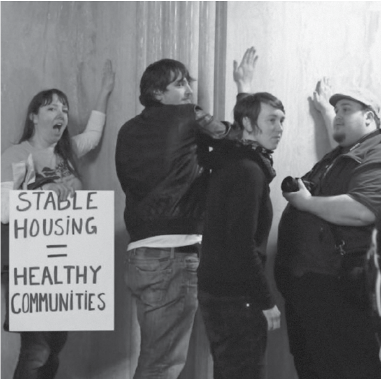
Protesters pound on the walls outside of the House Chamber in the Capitol building in Salem Thursday as lawmakers debate a higher minimum wage, rent controls, and an end to state highway department sweeps of homeless camps.