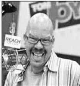
Tom Joyner 3am - 7am

KBMS Radio 1480 AM Portland's best music station