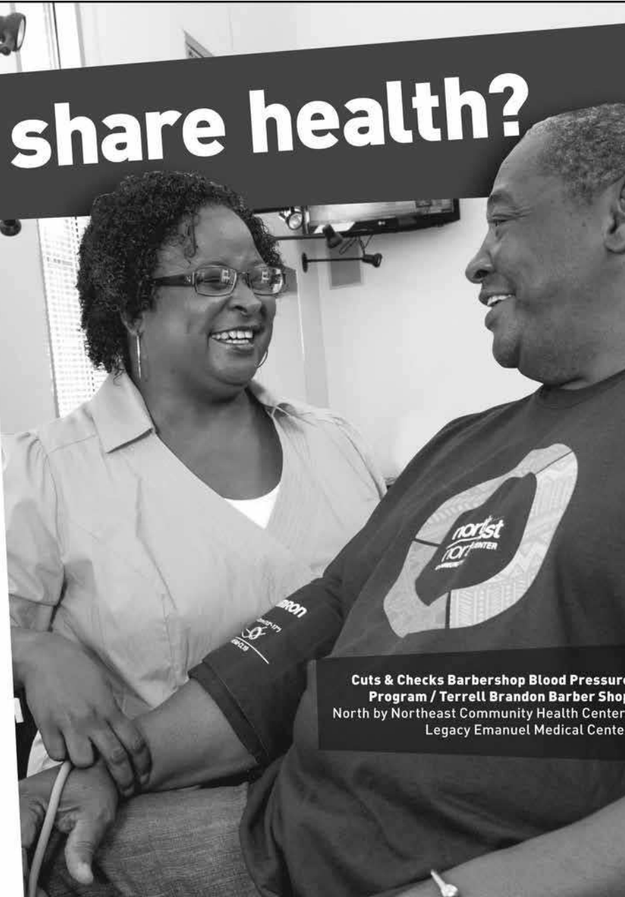
Cuts & Checks Barbershop Blood Pressure Program / Terrell Brandon Barber Shop North by Northeast Community Health Center/ Legacy Emanuel Medical Center