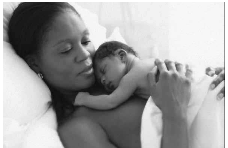
A new study looks at the risks of giving birth inside and outside a hospital setting.

KBMS Radio 1480 AM Portland's best music station