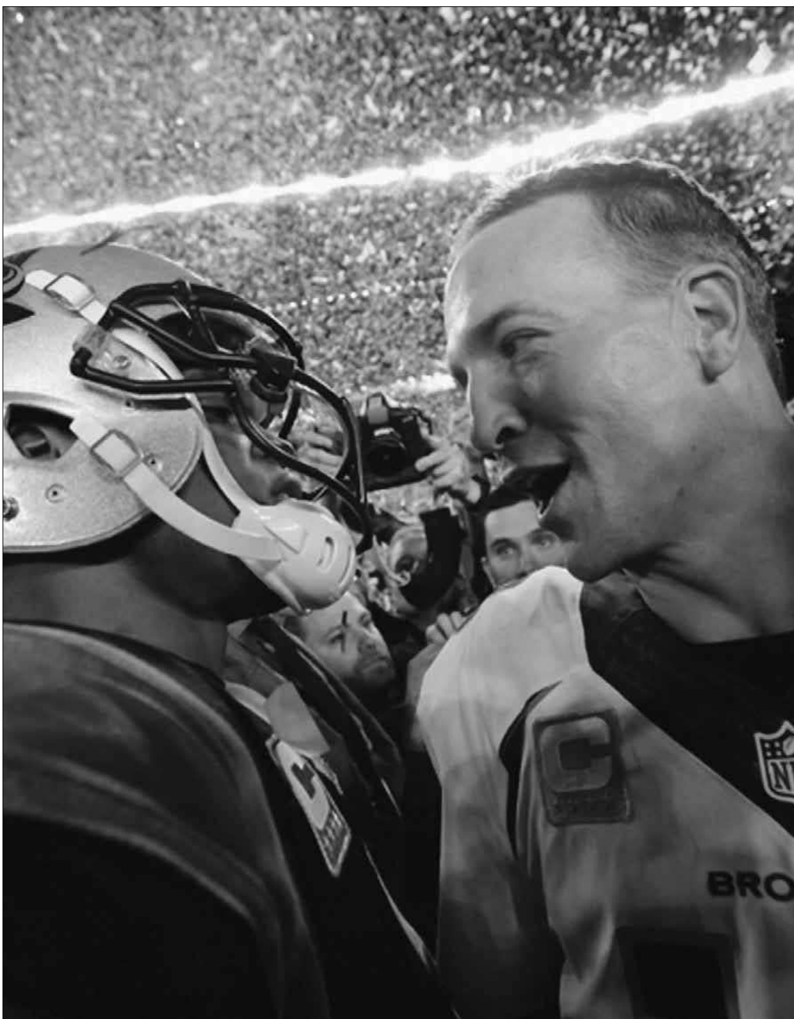
Carolina Panthers Cam Newton (left) congratulates Denver Broncos Peyton Manning after Denver scored a 24-10 victory in Super Bowl 50.