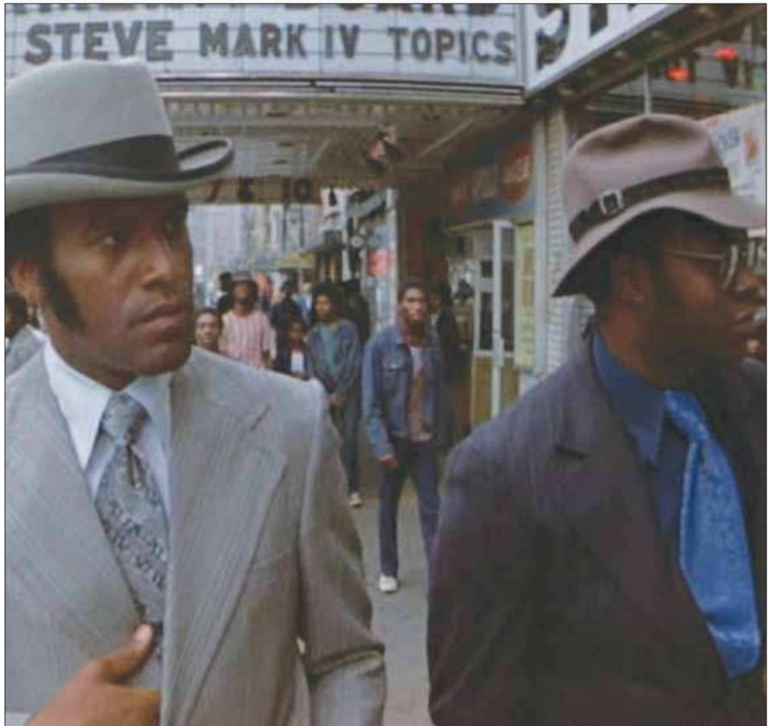
Black Caesar is a 1973 blaxploitation crime drama film starring Fred Williamson and Gloria Hendry and a musical score by James Brown. The film will play Saturday, Feb. 27 at 7 p.m. with Williamson in attendance as a special guest as part of the fourth annual Portland Black Film Festival at the Hollywood Theater, 4122 N.E. Sandy Blvd.