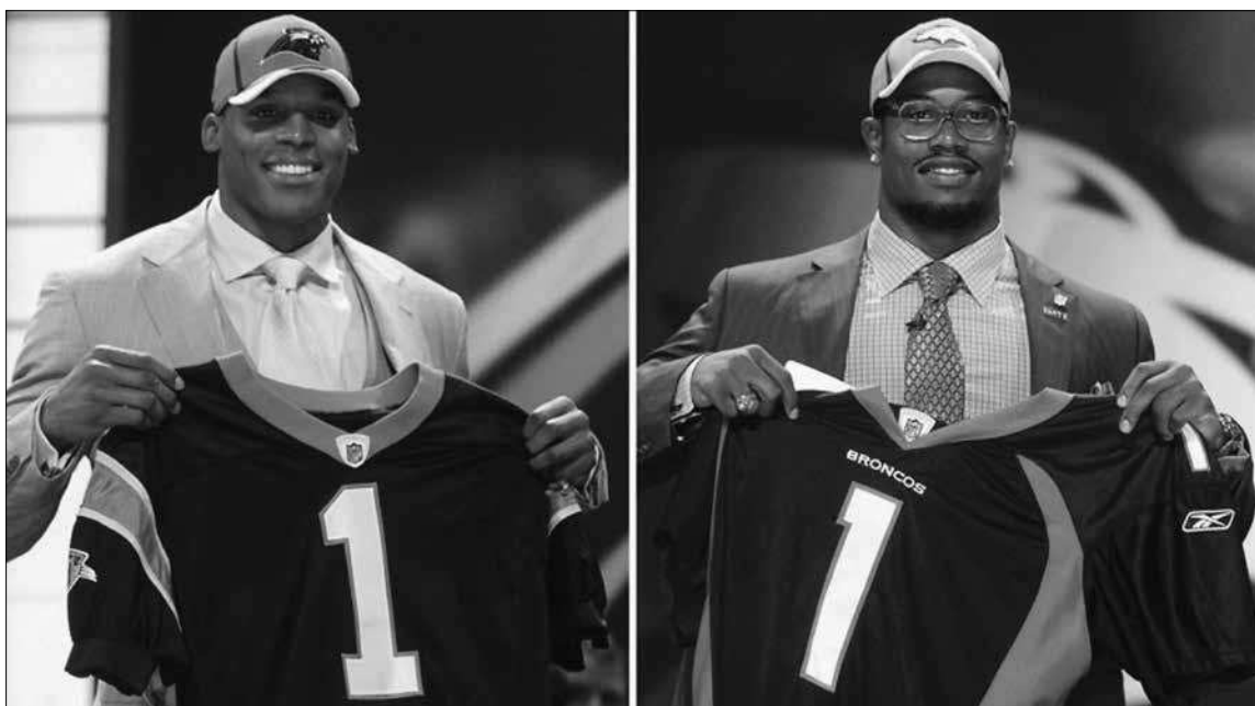
In 2011, Cam Newton (left) was the No. 1 draft pick overall selected by the Carolina Panthers, and Texas A&M linebacker Von Miller, was the second overall pick selected by the Denver Broncos. Five years later, the first-ever matchup of No. 1 vs. No. 2 will face off Sunday in the Super Bowl.

Indeed, they both play the game with childlike cheerfulness, dancing or dabbing to celebrate their success.